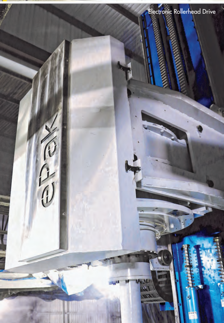
Electronic Rollerhead Drive